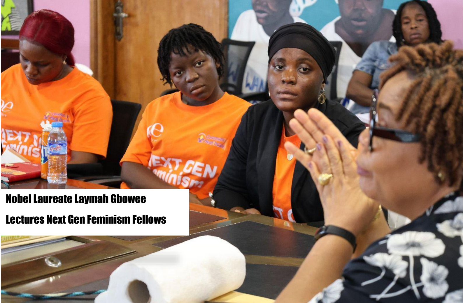
Nobel Laureate Laymah Ghowee Lectures Next Gen Feminism Fellows

On August 11 , the Next Gen Fellows had the honor of visiting the Gbowee Peace Foundation Africa , where they were warmly received by Nobel Laureate Leymah “Aunty Laymah” Gbowee and her team. The session provided not only an introduction to the foundation’s vision and mission but also valuable lessons on personal growth, leadership, and feminist advocacy. “Aunty Laymah” highlighted the foundation’s vision of “ an empowered population of women and youth committed to a transformed, peaceful, and reconciled Africa, ” and its mission “ to provide outstanding education and learning opportunities to women and youth. ” She emphasized that these guiding principles are deeply connected to the larger struggle for justice, peace, and equality across the continent.