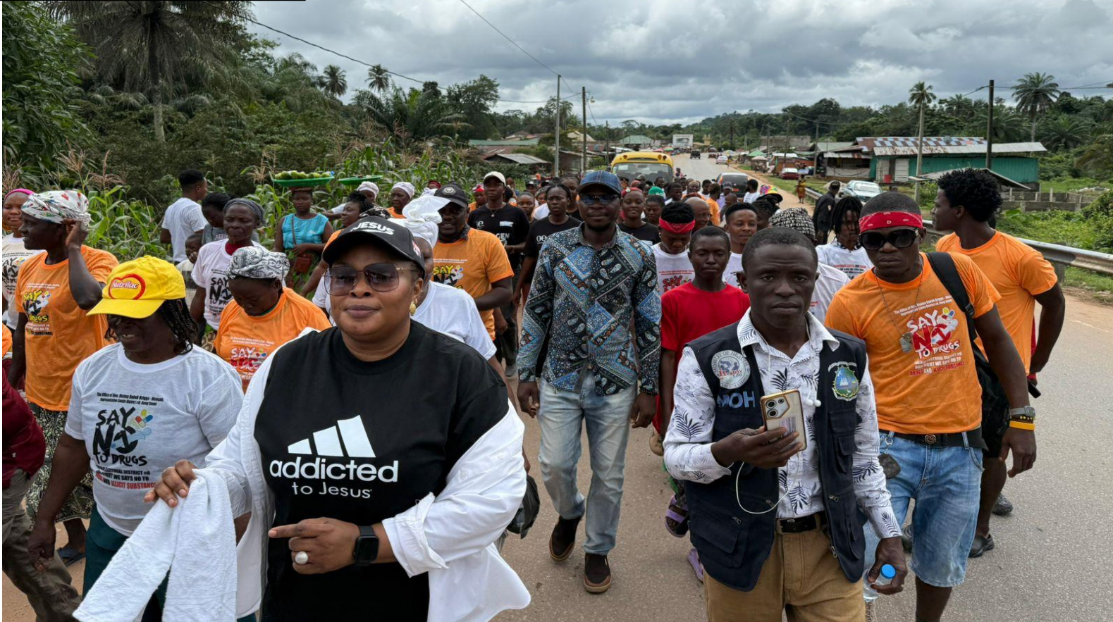
Hon. Moima Briggs Mensah Leads Next Gen Feminists in Salala District Bong County during an anti-drug abuse awareness